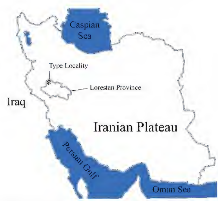
Fig. 1. Map showing the type locality of Lakigecko aaronbaueri sp.n. in the Garmabe region, Nourabad, Lorestan Province, Iran.

spinicauda, n = 3), Carinatogecko (C. heteropholis: n =29; FTHM 003400–003428; C. aspratilis , n = 12, FTHM 003300-003311; C. ilamensis, n = 3), Bunopus (B. tuberculatus : n = 12, FTHM 003200–11). Other data were taken from Minton et al. (1970), Anderson (1973, 1999), Golubev and Szczerbak (1981), Nazarov et al. (2009), Ahmadzadeh et al. (2011), Fathinia et al. (2011), Torki (2011), and Safaei-Mahroo et al. (2016). Abbreviations: TT: Tail tubercle distribution (D: dorsal; L: dorsolaterals; V: ventral); TS: tail shape (S: squat, i.e., short and thick; Q: not squat, i.e., more elongate); LT: Lamella type (M: smooth; K: keeled); DT: dorsal tubercles in each segment (C: in contact; D: not in contact); DS: dorsal scales between whorls (E: elevated; N: not elevated); GS: digits shape (A: angular; S: sub-angular; W: weakly angular; N: not angular); FP: femoral pores (+: present; -: absent); ES: eye shape (G: Globular; E: Ellipsoid); and HA: head angle (degree of lateral view between lower ear-nostrilupper eye).